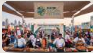
Global Culinary Demonstrations