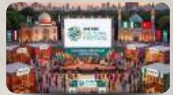
Cultural Heritage Showcase