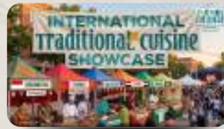
International Traditional Cuisine Showcase