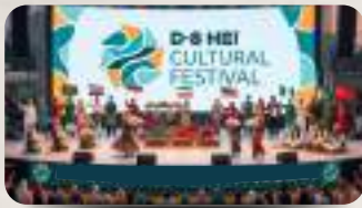
Cultural Stage Performances

Discover the richness of cultures from the Developing-8 (D-8) member states and beyond, where halal values are reflected in daily traditions, culinary heritage, and creative expressions. The festival presents traditional performances, authentic halal cuisine, and a diverse range of cultural experiences from participating countries. Experience cultural harmony, connection, and celebration in one vibrant destination.